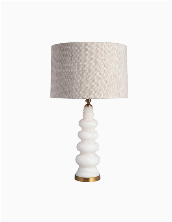
TABLE LAMP | BLANCA