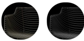
Matt painted bronze X100 Matt painted black nickel X101