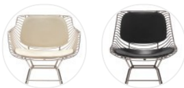
Ivory leather col.28 Black leather col.2