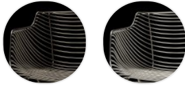
black chrome nichel chrome