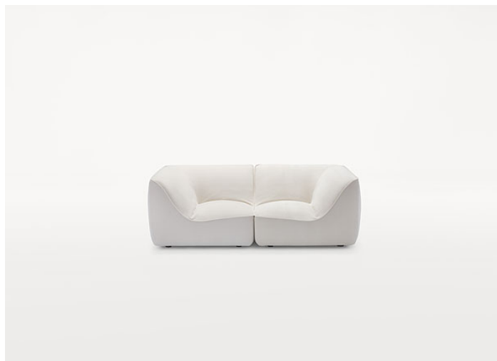
B33AS + B33AD