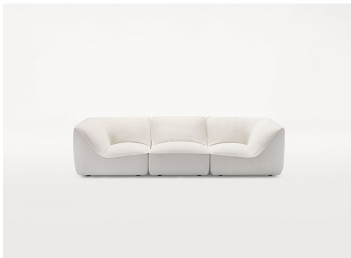
B33AS + D33B + B33AD