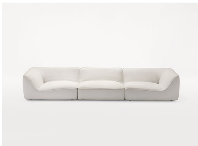
B33ES + B33H + B33ED