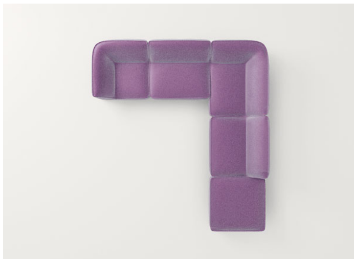
B33AS + n°2 B33H + B33ES + B33G