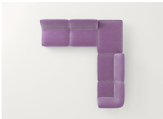
n°3 B33H + B33F + B33AD