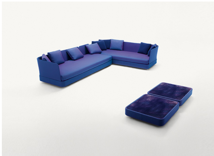
B25D + B25N + n° 2 B25SCS + n° 4 B25SCA + B25SCD + n° 2 B25H