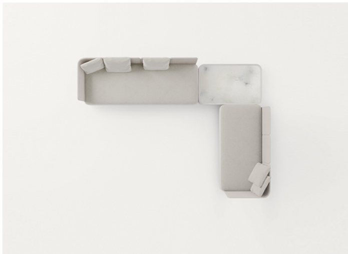
B25D + B25SCS + n° 3 B25SCA + B25L + B25N + n° 2 B25SCA + B25SCD