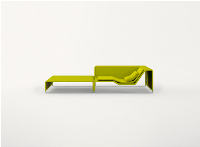
B11PB + B11CLD