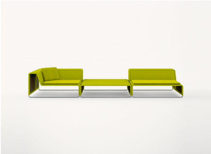
B11S + B11PB + B11C