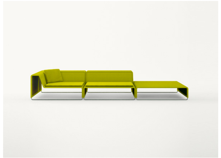
B11S + B11C + B11PB