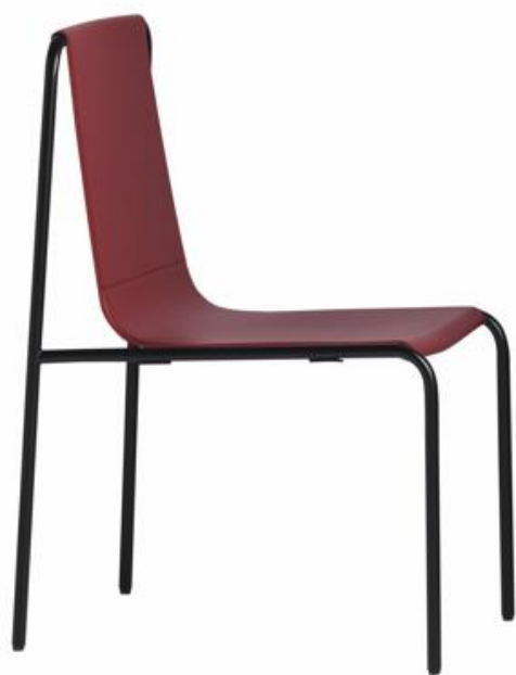
Aria FG 545.00 Designer: Steve Leung

Sedia con struttura in acciaio verniciato, scocca rivestita interamente in cuoio.